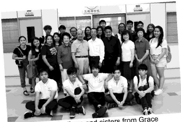
17/01/2017: Brothers and sisters from Grace Methodist Church, Perth, Australia West District.