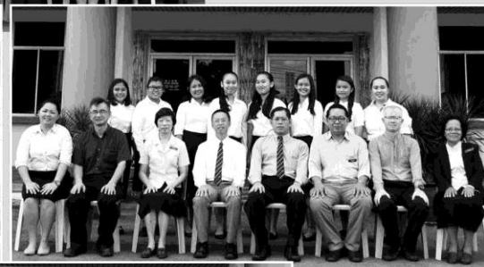
<< The 8th Batch of STMS Music students (21 students)