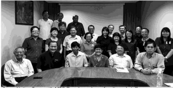
Accreditation Team with MTS Board members, faculty and staff.