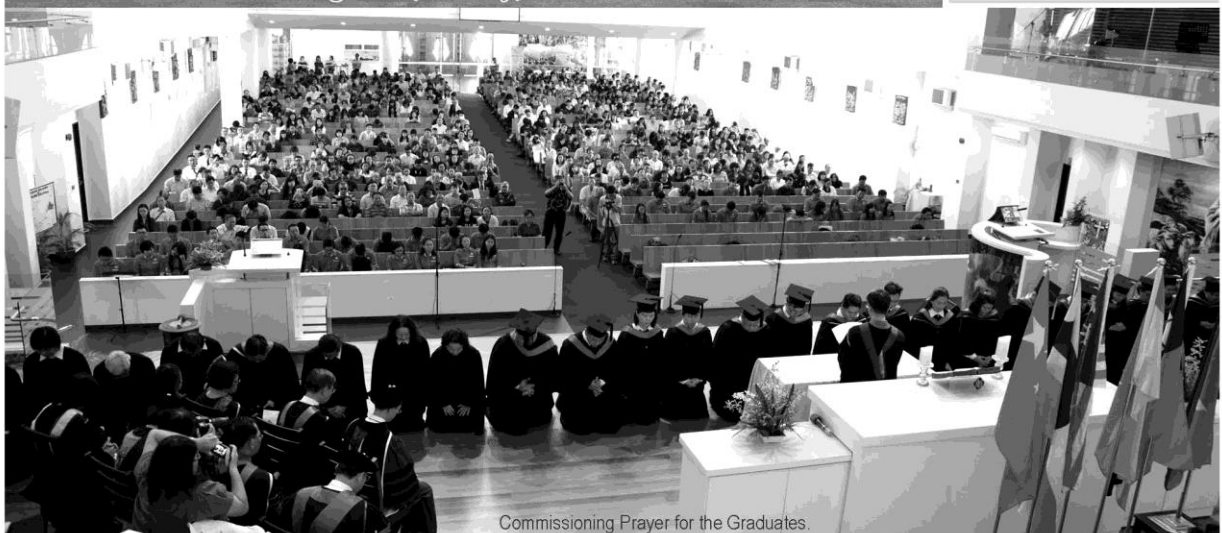
Commissioning Prayer for the Graduates.