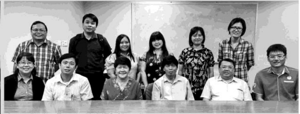
Accreditation Team with MTS Alumni.

ATESEA Accreditation Team came on Oct 6-7 to accredit our programs. They highly praised our school's fine work and strongly affirmed our M. Div, B. D. and B. Th. programs, including missiology, Worship & Music programs.