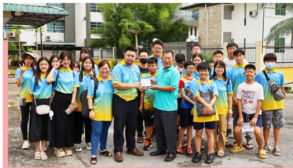
28 th May 2024: Chinese youth from BEM Bintulu Evangelical Church