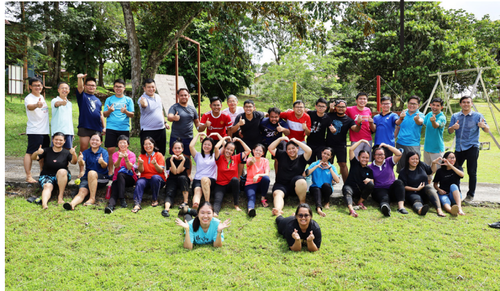
26-27 October: MTS Camp 2D1N at Bukit Lan Outdoor Activities Centre.