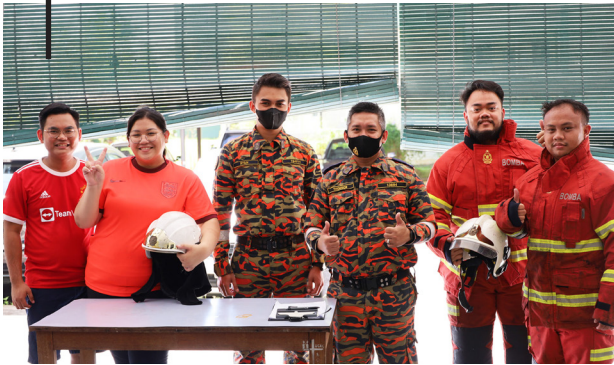
20 August: Fire drill conducted by Bomba for the MTS community.