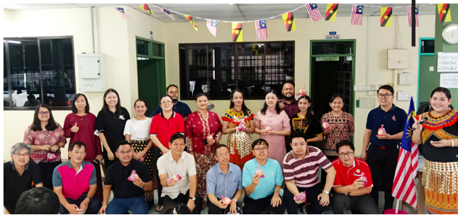
26 August: MTS Family Dinner (National Day & Birthday Celebration)