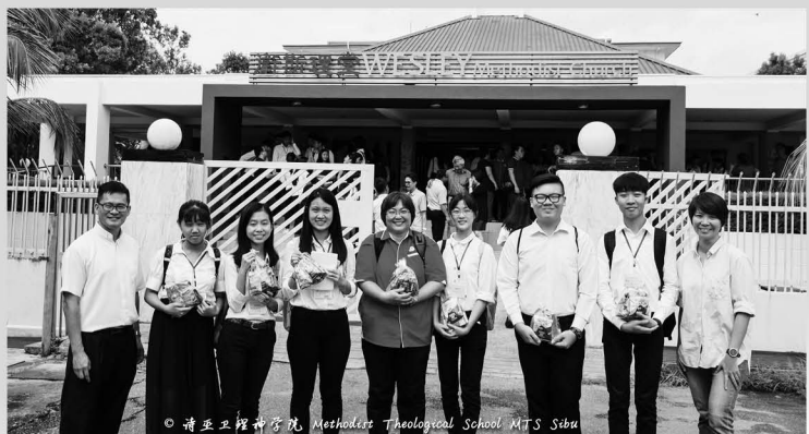
02 Jan: MTS First Semester Opening Service, 9:00am at Wesley Methodist Church.