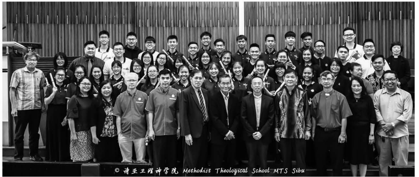
◎ 诗亚卫理神学院 Methodist Theological School MTS Sibü

22 Mac: MTS Night (Chinese), 7.15pm at Xin Fu Yuan Methodist Church.