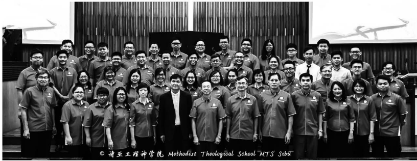
◎ 诗亚卫理神学院 Methodist Theological School MTS Sibü

22 Mac: MTS Night (Chinese), 7.15pm at Xin Fu Yuan Methodist Church.