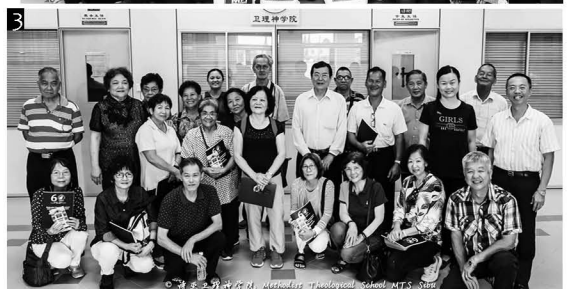
◎ 诗亚卫理神学院 Methodist Theological School MTS Sibü