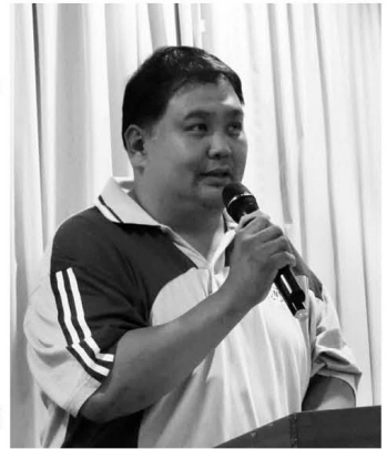
Representative from Cheng Uong MC delivered a short speech.

MTS Community was invited to a Chinese New Year Celebration Dinner at Tang's Restaurant, Sibul, by some brothers and sisters from Cheng Uong Methodist Church on February 1st. Besides that, they also gave us ang paus. We would like to express our deepest gratitude to them for their loving care every year.