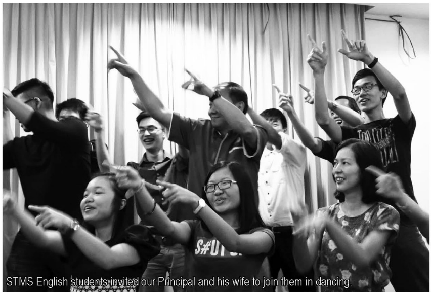
STMS English students invited our Principal and his wife to join them in dancing.