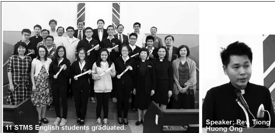
11 STMS English students graduated.