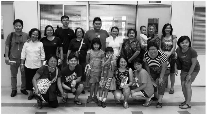
(clockwise from top left) 18/04/2015: Brothers and sisters from Setiawan.