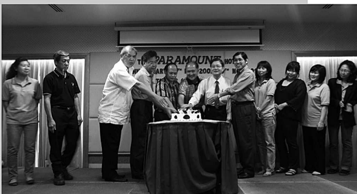
Cake cutting ceremony by the Board members & staff of Paramount hotel, and some MTS lecturers