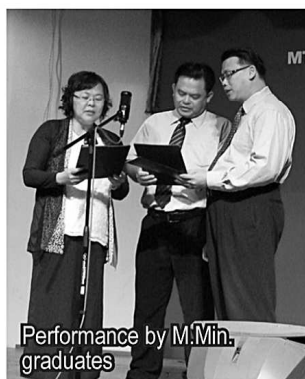
Performance by M.Min. graduates