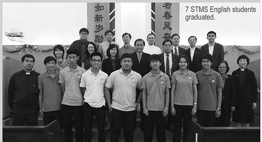
7 STMS English students graduated.

Venue: Wesley Methodist Church, Sibuluan