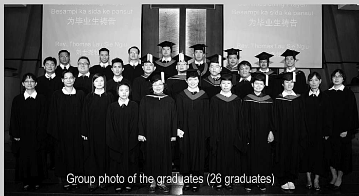
Group photo of the graduates (26 graduates)