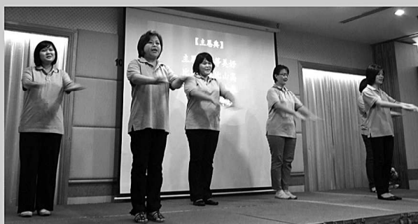
Performance by the staff of Paramount Hotel

The whole MTS community, including lecturers & their family members, students and staff again were invited to attend and to lead the service.