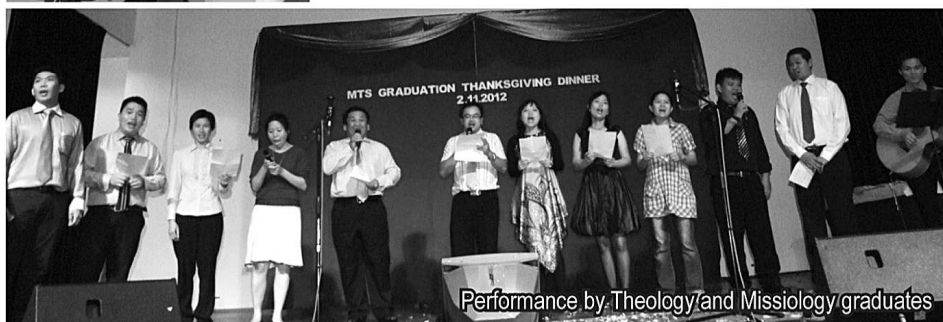
Performance by Theology and Missiology graduates