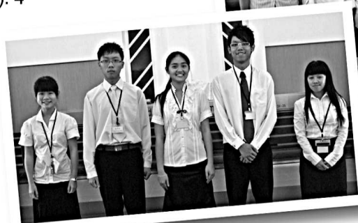
1 st Year Students (Worship & Music Program)