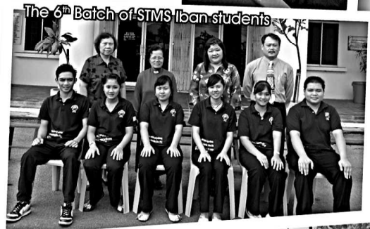
The 6 th Batch of STMS Iban students

There were 55 STMS Chinese students, 6 STMS Iban students and 22 STMS Music students graduated.