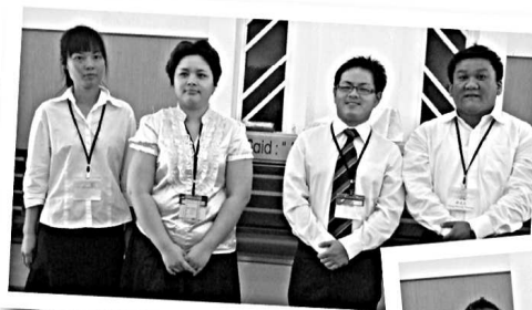
1 st Year Students (Theological Program - Chinese)