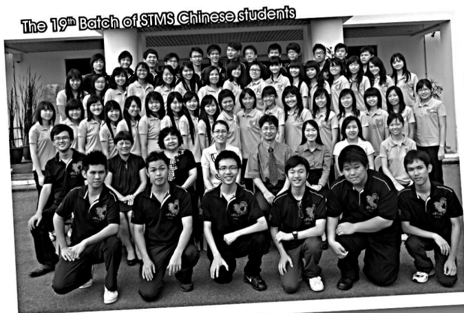
The 19 th Batch of STMS Chinese students