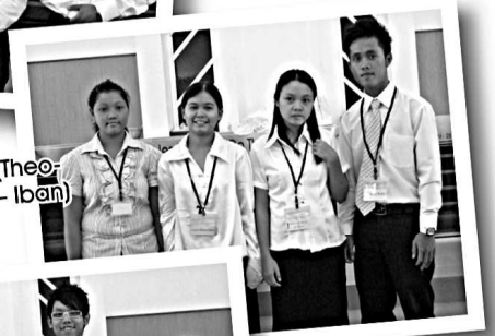
1 st Year Students (Theological Program - Iban)