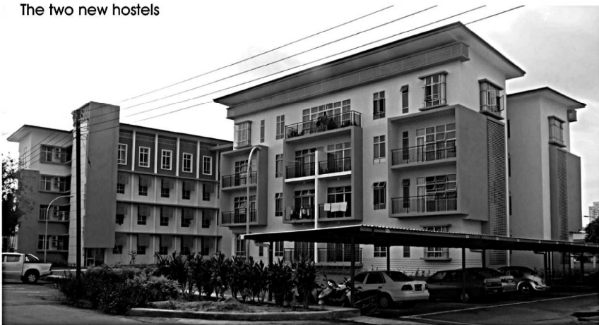
The two new hostels

vided by any conference; students have to pay the fees on their own or through the support given by the churches. So we need financial support especially for the needs in the Iban Department. Please remember us in your prayer.