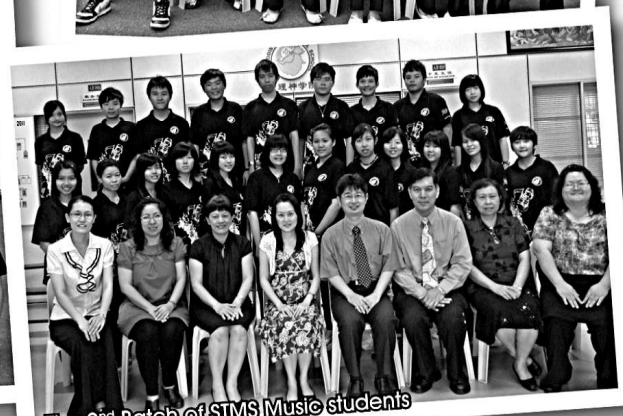
The 2 nd Batch of STMS Music students