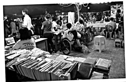
Methodist Care Centre was invited to participate during the festival; There were also some Christian books on sale.