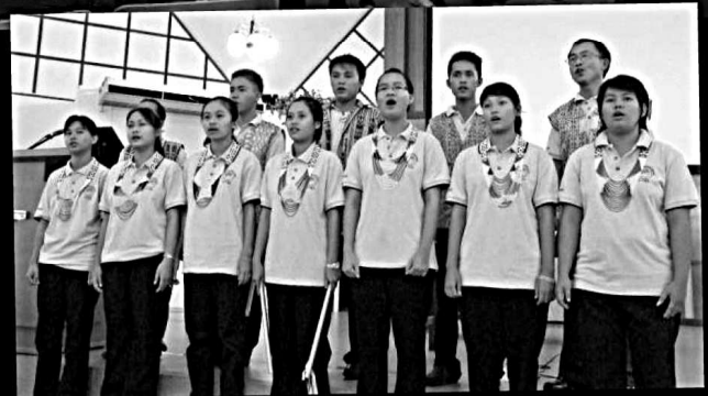
The 5th Batch of STMS Iban students