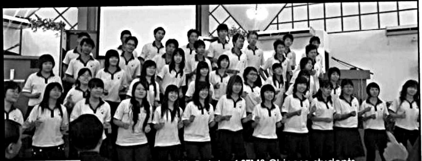
The 18th Batch of STMS Chinese students

There were 41 STMS Chinese students, 12 STMS Iban students and 33 STMS Music students graduated.