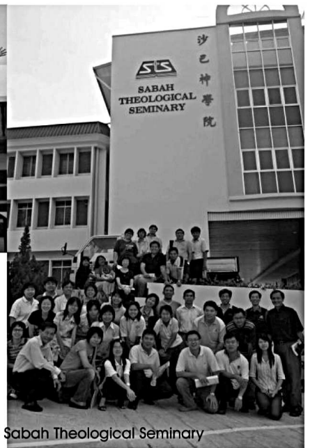
Visited Sabah Theological Seminary