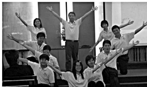
MTS Night at Shern En Methodist Church, Sabah

A group of 39 MTS lecturers and students from the Chinese department went to Sabah on 26th June for 3 days and 2 nights. They were assigned according to their family groups to various churches in Kota Kinabalu to conduct Theological Sunday services. Other than that, MTS night (26th June) and Dedication Camp (28th June) were organized at Shern En Methodist Church, KK. Some of the lecturers and students had a chance to visit Sabah Theological Seminary on 28th June.