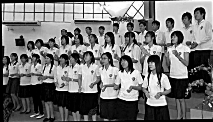
The 1st Batch of STMS Music students